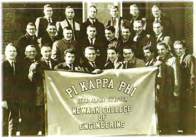
Brothers of Pi Kapp - 1963.

The Beta Alpha chapter was founded at the Newark College of Engineering (now NJIT) on May 29, 1948. Since then, 61 years of on-campus leadership and activities have benefitted more than 800 initiates. After graduation these Pi Kapp men have gone on to have long and successful professional careers in many diverse fields. Many of us attribute our professional and personal success to the Beta Alpha experience and the learning opportunity that the fraternity provided. Alumni from all eras gather for chapter and national events to recount their experiences as well as to have fun and enjoy each other's company. We hold annual events such as Founder's Day and an undergraduate/alumni retreat that gives Beta Alpha Alumni the opportunity to provide advice and guidance to the undergraduate brothers. The undergraduate chapter is held in high regard on campus. Although the chapter numbers are on the historically low side (a Greek System-wide issue) they maintain above average membership numbers when compared to the other fraternities on campus. The chapter is competitive during Greek Week each year, always placing in the top three positions, and has a great leadership relationship with NJIT's Greek Life advisor. Beta Alpha has been active with our national fraternity's philanthropy Push America by sponsoring fundraising and awareness activities on campus. Most recently they held a pushup-athon in the campus center where they did pushups while NJIT students donated to the cause.