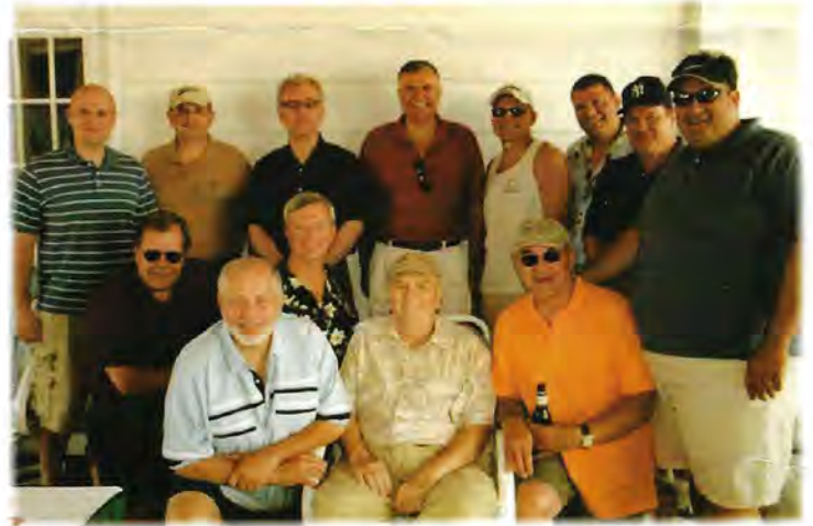
Beta Alpha Alumni - Fourth of July 2009.