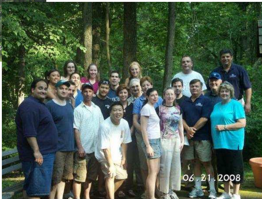
Right- Group shot of most of the attendees at the first annual Ba Picnic. 6/21/08