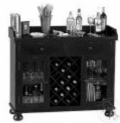
Howard Miller Wine Furniture