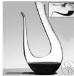
Riedel Amadao Lyra Decanter

Eurocave - French Craftmanship has resulted in the most technically advanced Wine Cellar in the World We have stand alone wine cellars from 6 - 1,000 bottles or Custom Designed Wine Cellars