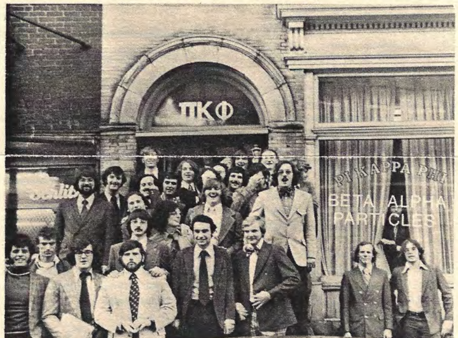
Beta Alpha, in the Spring of 1973, following a formal meeting